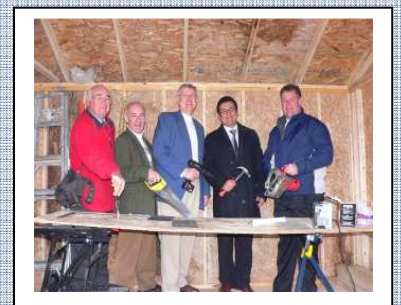
DG Doug completes his visits to all 52 clubs in our district!